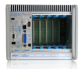
Empty 5-slot BE103 BILT chassis