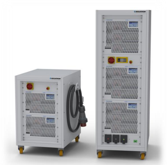
Figure 4: REGATRON's rack-integrated turn-key system solutions, e.g., 72 kW (left) and 162 kW (right) power levels. Various types of AC/DC connectors and cables allow for comfortable handling. Third-party product integration and numerous safety options are additional features.