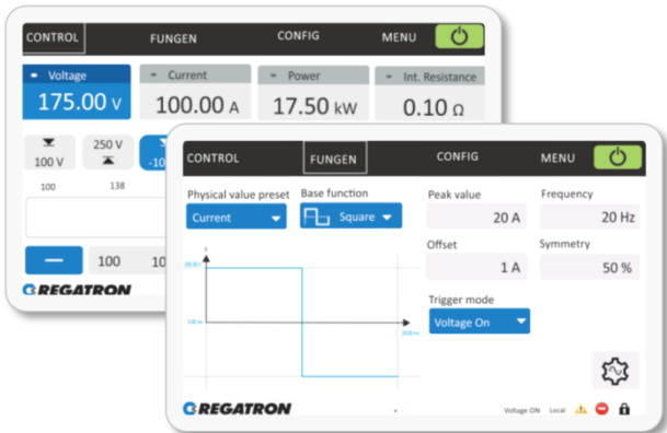
Figure 3: Intuitive control by HMI touch display. Everything you need at a glance.

The HMI built into the front panel allows comprehensive and convenient operation of the power supply via touch display.